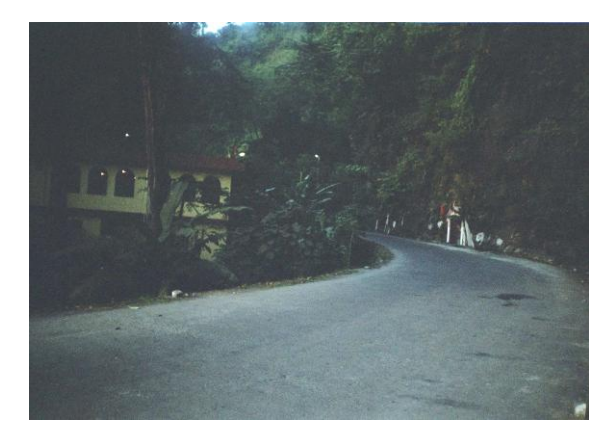
Fig 4.1: Cultural Place at Rolu Village along the road

there are two temples (km 8 and km 25) which are coming within ROW and adjacent to existing carriageway. Care must be taken to avoid any damage to these structures. Also earthworks, as associated with the actual road construction/improvement works, or deriving from secondary sites such as quarries or borrow pits, may reveal sites or artefacts of cultural/archaeological significance. Fig. 4.1 shows the typical temple along the road. In the event of such discovery, the proper authorities should be informed and the requirement to take such action should be incorporated in contract documents.