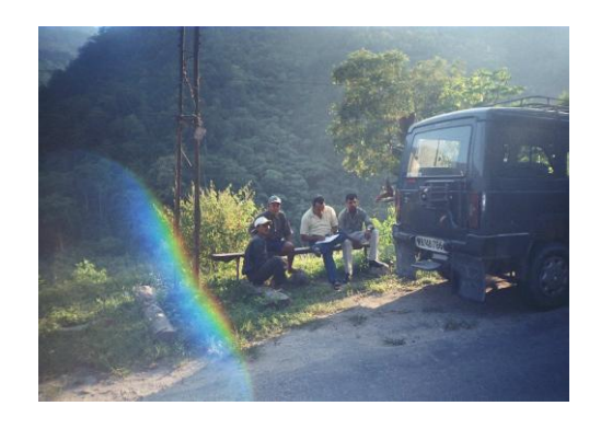
Fig 6.1: View of Community consultation

257. In order to access the existing environment and likely impacts on PAPs, an