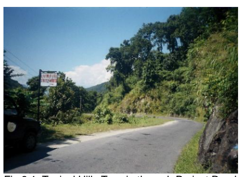
Fig 3.1: Typical Hilly Terrain through Project Road

34. The geological formation is of recent origin resulted by nine repetitive successions of Neocene arnaceous and argillaceous sediments gradually thrown into series of North-South trending longitudinal, plunging anti-clines and synclines. In the higher elevations arnaceous formations occur while the low-lying areas and depressions are represented by argillaceous rocks. The common rocks found are sandstone, shale, silt, stone, clay stones and slates. The rock system is weak and unstable prone to frequent seismic influence. The local geology is highly important for the success of road projects. Unstable rock formations and high precipitation combine to make many areas landslide prone. Such areas need to be approached cautiously – measures must be taken to select alignments that minimise the likelihood of land-slides and/or damage from land-slides.