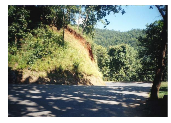
Fig 4.2: Landslide prone location along the road

151. All hill/soil cutting areas should be revegetated as soon as construction activities are completed. At more vulnerable locations, selected bioengineering techniques should be adopted - a combination of bioengineering techniques and hard engineering solutions such as rock bolting and the provision of bank drains may be required. Solutions will, however, need to be individually tailored by the geo-technical/ environmental experts of the Supervision Consultant. Fig. 4.2 shows the typical landslide on project road.